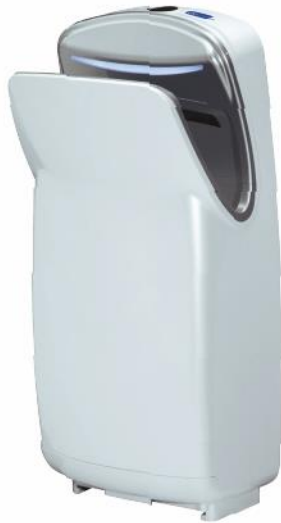
WHITE | BE1000W