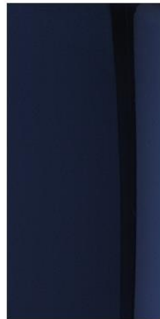
BLUE | BE1000B