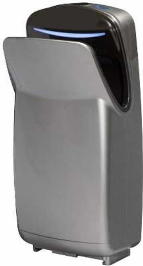
SILVER | BE1000S