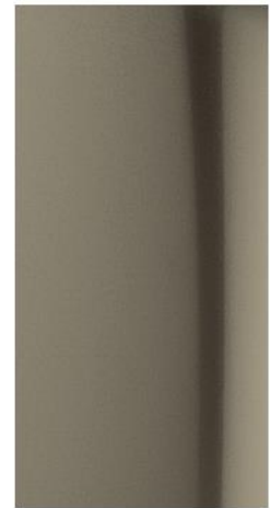
GOLD | BE1000G